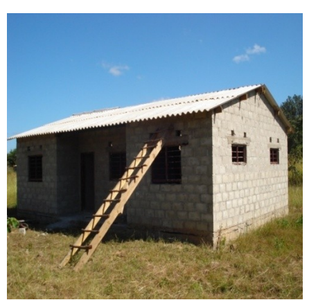
Two incomplete staff houses at Kabanda Rural Health Centre