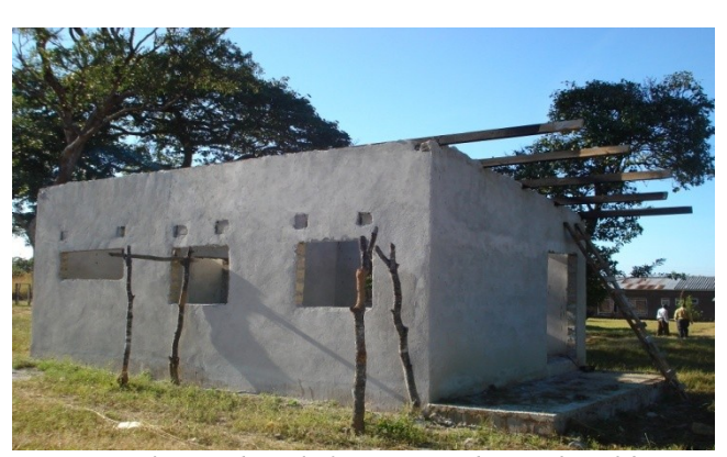
An incomplete Kitchen Block at St. Dorothy Rural Health Centre