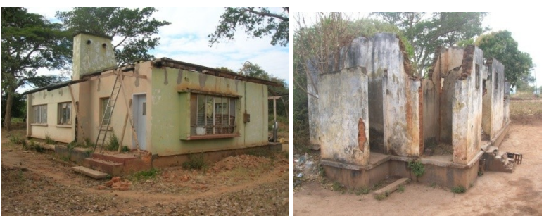
The Dilapidated House and Servant's Quarters purchased by DEBS

Further, though records indicated that K19,584,500 was spent on the renovations, the house was still in a dilapidated state as can be seen from the pictures below: