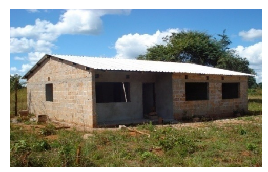
\label{lem:complete} \textit{An incomplete Medium Cost Staff House} \ - \textit{Kibangabwe Middle Basic School}