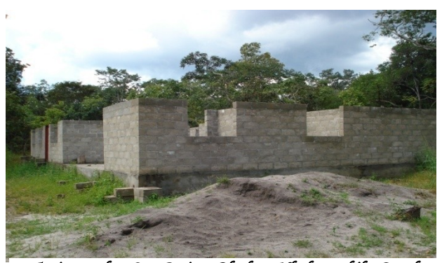
An incomplete Out-Patient Block at Nkulumazhiba Rural Health Centre

Enquiries made with the Provincial Administration revealed that the works could not continue because Ministry of Finance and National Planning had mopped up the funds at the end of the financial year. See picture below: