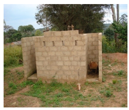
An incomplete medium cost Staff House and VIP latrine - Ng'oma Middle Basic School