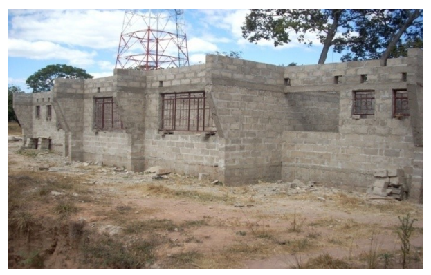
Incomplete Mungwi District Commissioner's office