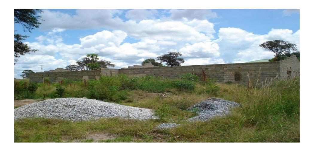
A semi-detached house under construction at Solwezi Urban Clinic