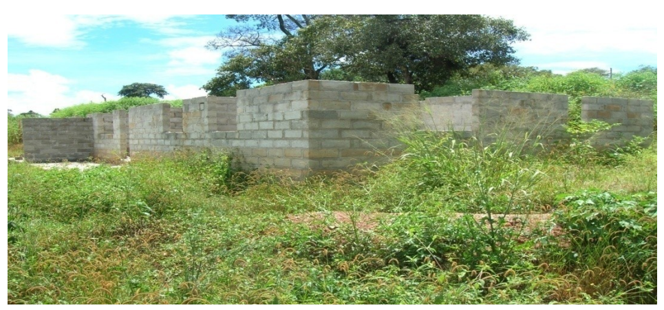
A semi-detached house under construction at Solwezi General Hospital

The works were to be completed in six (6) months effective from 18<sup>th</sup> April, 2007. However, as of April, 2008 the house had not been completed, a delay of 12 months. See picture below: