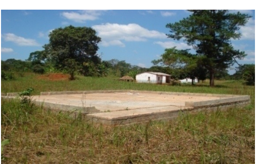
An incomplete medium cost staff house