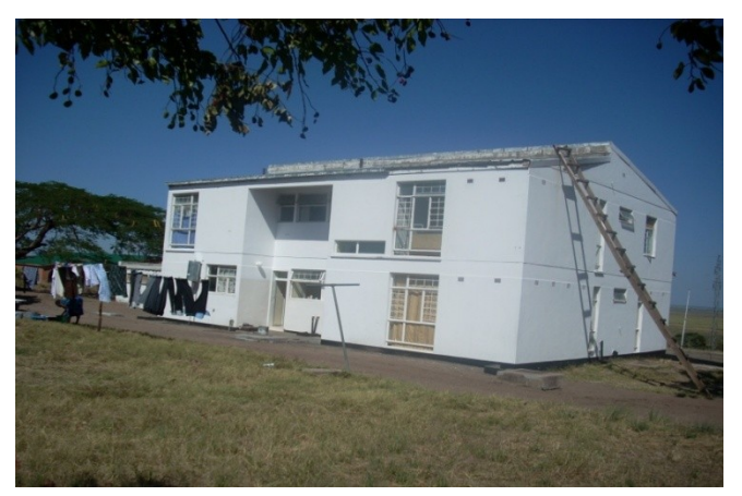
Partly Rehabilitated Katongo Presidential Guest House