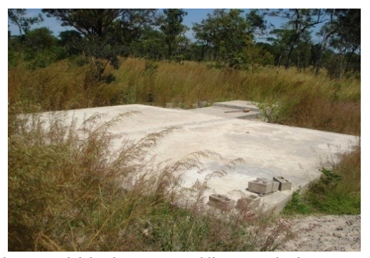
An incomplete medium cost staff houses at slab level - Lumwe Middle Basic School