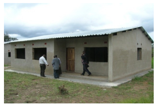
An incomplete medium cost staff house Nyakaseya Middle basic School