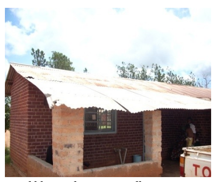
Old hospital structure still in use

HEAD: 46/12 MINISTRY OF HEALTH – EASTERN PROVINCE