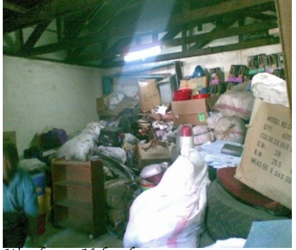
Seized goods in State Warehouse-Nakonde