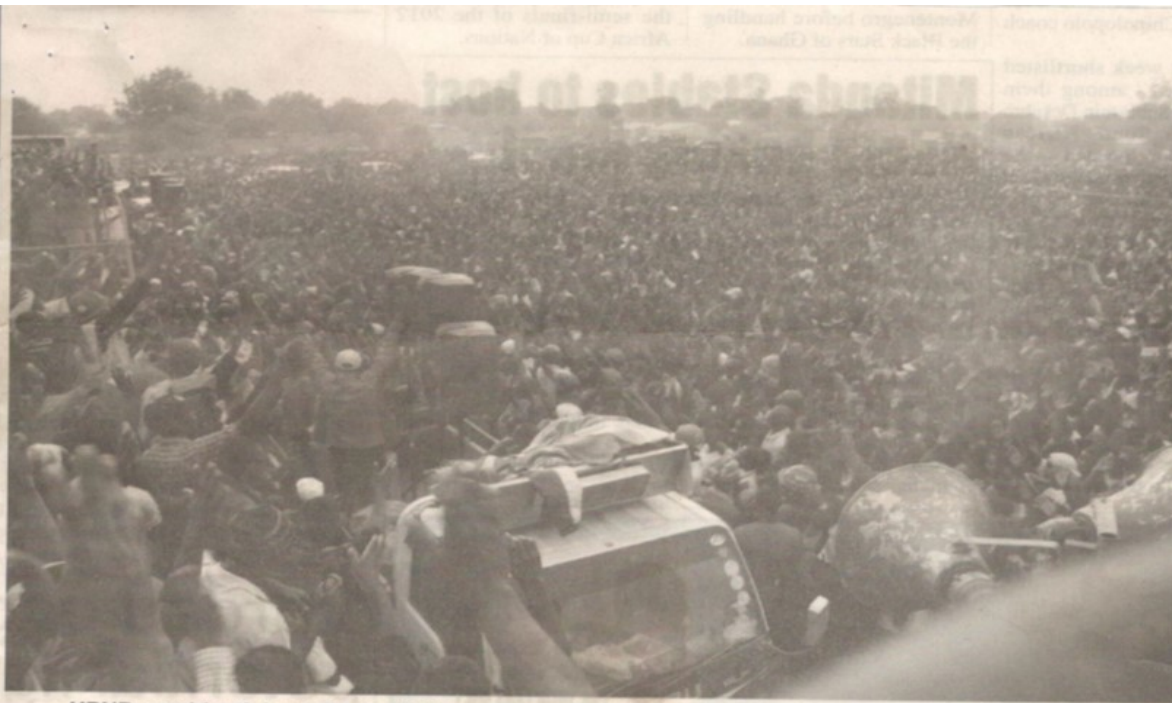
UPND presidential candidate Hichilema at a rally in Solwezi on Friday