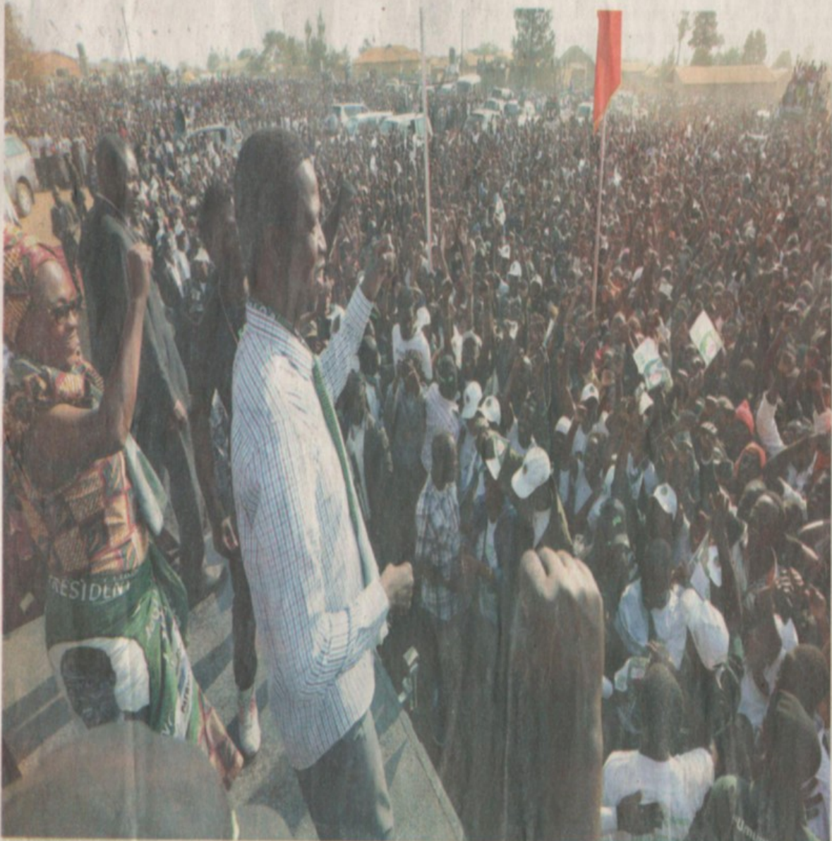
PRESIDENT Lungu during a rally in Nakonda yesterday.

■ Lungu commissions Kapasa Makasa University in Chinsali