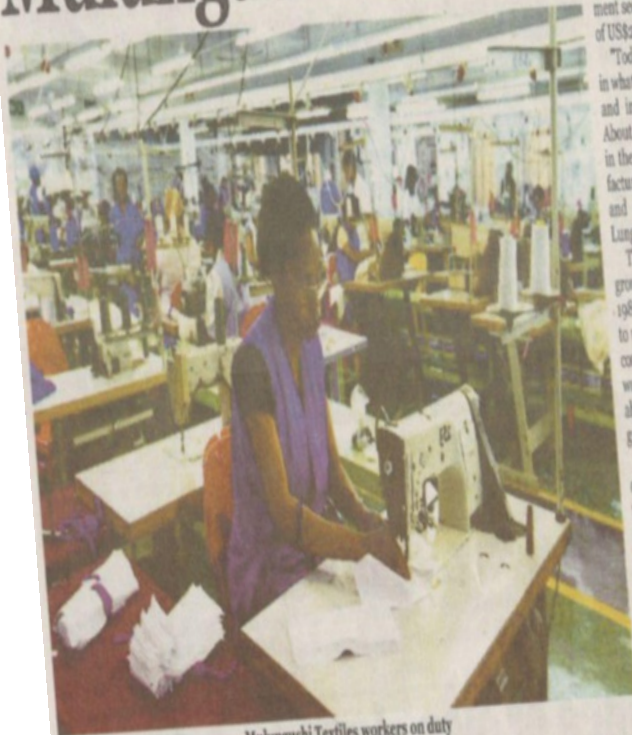
Mulungushi Textiles workers on duty